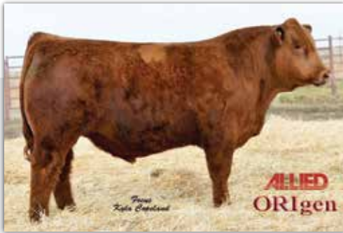
WS ALL ABOARD B80