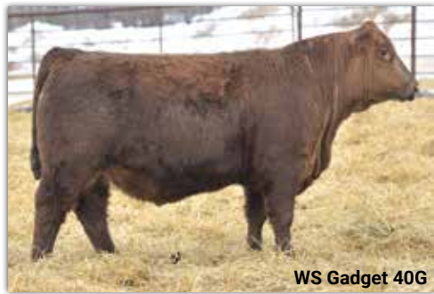
WS Gadget 40G