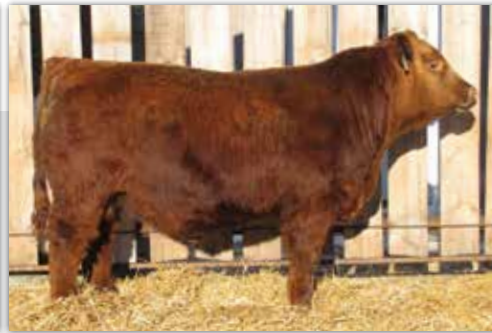
RFS FORCE F35