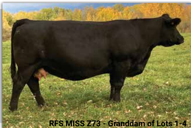
RFS MISS Z73 - Granddam of Lots 1-4