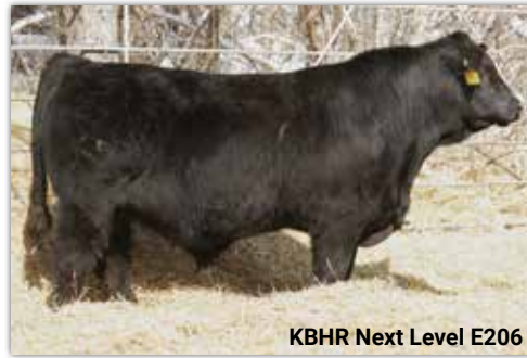
KBHR Next Level E206