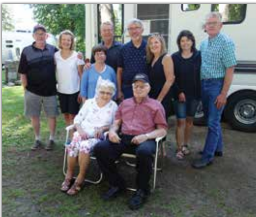
We celebrated 70 years of marriage and memories! We love you, Mom and Dad!