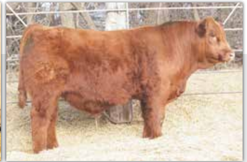
KBHR KINGSMAN E144