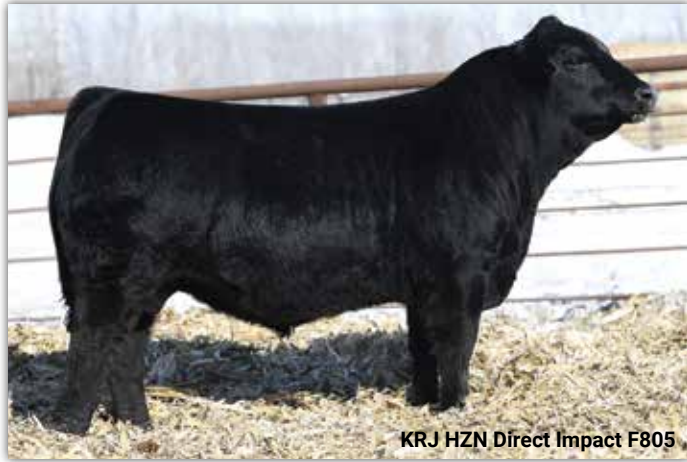
KRJ HZN Direct Impact F805