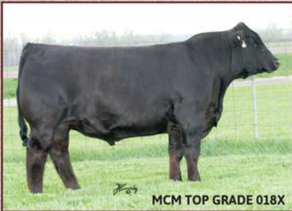
MCM TOP GRADE 018X