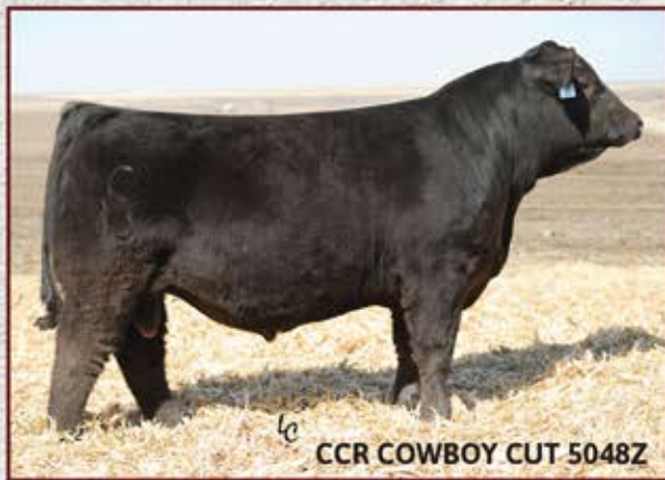
CCR COWBOY CUT 5048Z