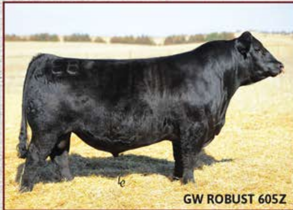
GW ROBUST 605Z