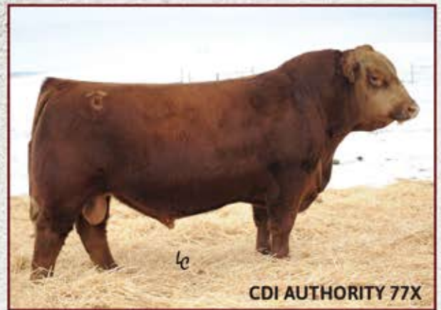
CDI AUTHORITY 77X